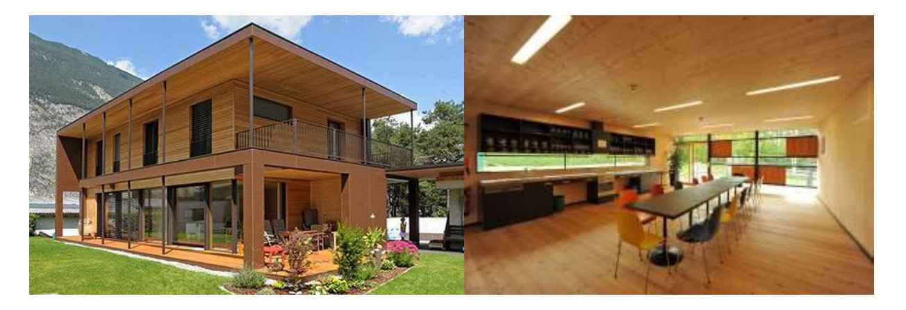
Figure 5, cross laminated timber family house

This type of wood has also many another positive sides and product advantages as ecologically sustainable building material, it is recommended in terms of building biology, has positive ecobalance, solid wood construction with lasting value, flexible design without a grid pattern, excellent static properties and comfortable room climate . Cross laminated timbet is healthy, compatible with steel, glass and other materials. It increase space thanks to slender construction elements and also gives freedom in architectural implementation.