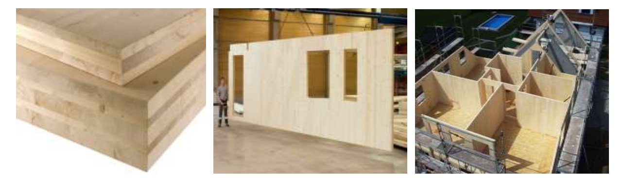
Figure 1, cross laminated timber

Wood products from responsible sources are a good choice for most green building projects, both now construction and renovations. Wood grows naturally, using energy from the sun, is renewable, sustainable and recyclable. It is an affective insulator and uses far less energy to produce than concrete or steel. Therefor new wood products and new building systems, like cross laminated timber (CLT), since more than ten years, had experienced considerable popularity with architects and civil engineers, CLT became interesting in green building because of its many positive characteristics.