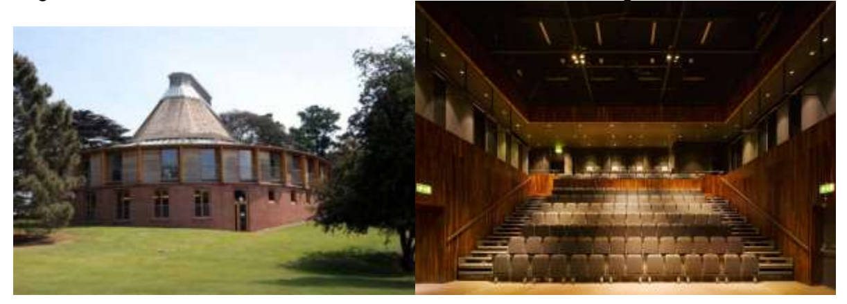
Figure 7, first cross laminated object in UK-Shrewsbury School music

By 2005 awareness of CLT as a structural building material and sustainable alternative to concrete and brick & block had been established and demand in Europe had increased dramatically. This was predominantly driven by the green building movement, improved distribution channels and enhanced marketing. By 2005 the number of European manufacturers producing CLT had also increased. Today there are 5 main producers all still based in Europe. As the demand for CLT grows over the next 5 – 10 years there will be a huge increase in the number of new entrants to the manufacturing market.